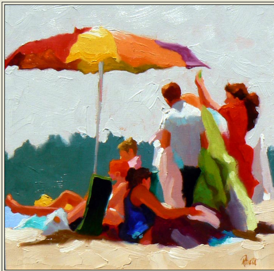
Rhett Thurman Packin' Heat II Oil on canvas