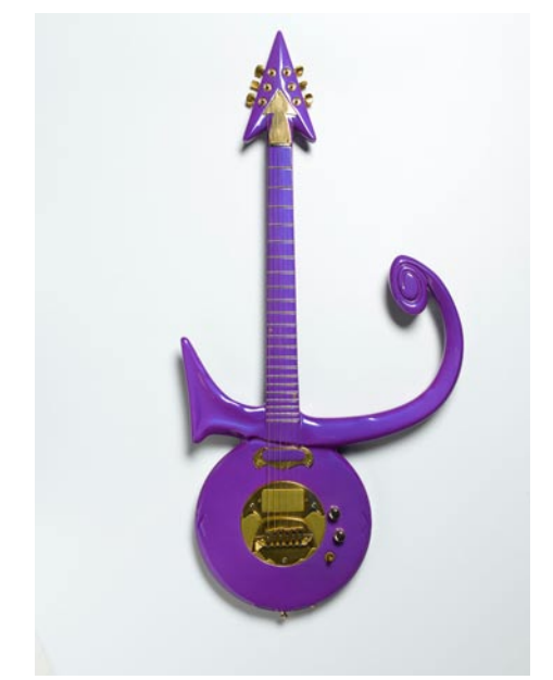
Guitar Prince played at the halftime show of the 2007 Super Bowl.

NC Institutional Gallery listings, call the Center at 704/547-3700 or visit (www. ganttcenter.org).