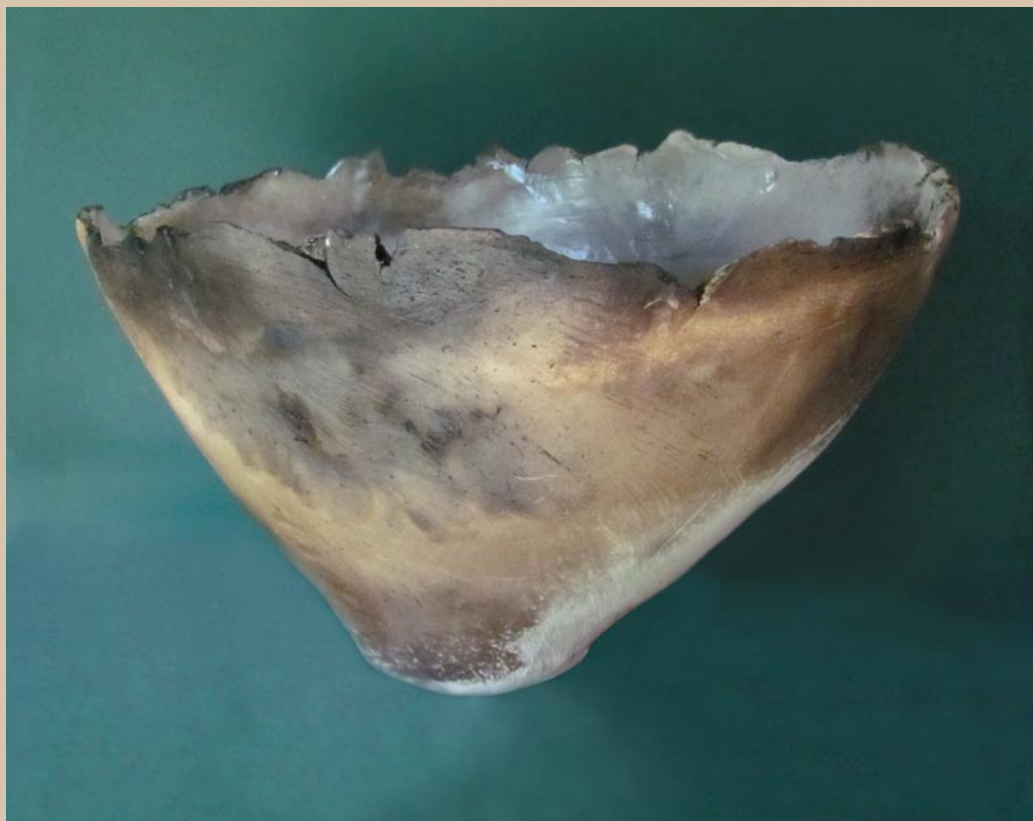
Sharon Campbell Untitled , 2009 terra sigillata, oxides 9.25 x 16 x 10.25 inches