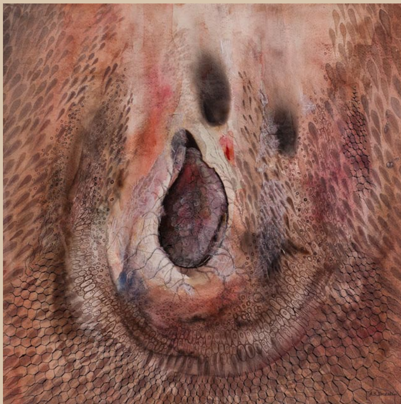
Jeanet Dreskin Sere Genreations AI , 2012 gouache, colloga inks 22.5 x 22 inches