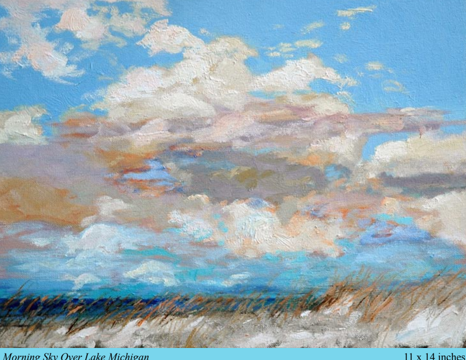
Morning Sky Over Lake Michigan

Haven't found the article about your exhibit yet? Did you send it to us? Don't feel left out. Be included. The deadline each month to submit articles, photos and ads is the 24th of the month prior to the next issue. This will be June 24th for the July 2012 issue and July 24 for the August 2012 issue. Don't put it off. Get your info to us - soon.