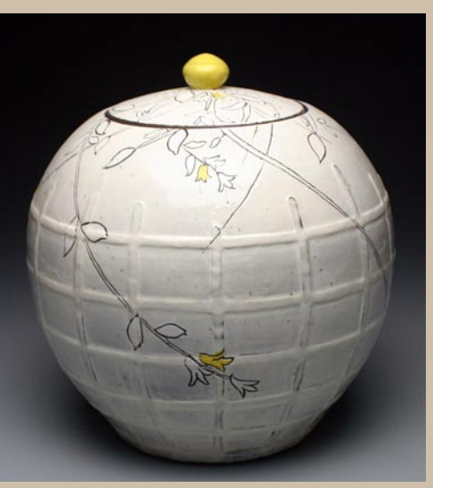
Work by Ben Carter

(<u>http://www.carterpottery.blog-spot.com/2009/05/welcome-to-tales-of-red-clay-rambler.html</u>).