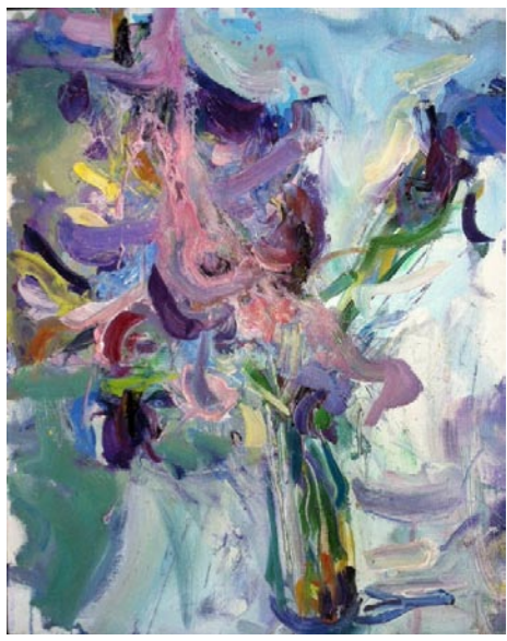
Work by Carl Plansky

Plansky, who died in 2009, is known for the texture, color, and energy that he brought to his paintings. An obituary published in The Examiner stated: "His surfaces look like the moon, building up to thick, craggy mountains of pigment and pockmarked with thin, perfect plains of washes. He was in love with the textures and colors of oil painting.'