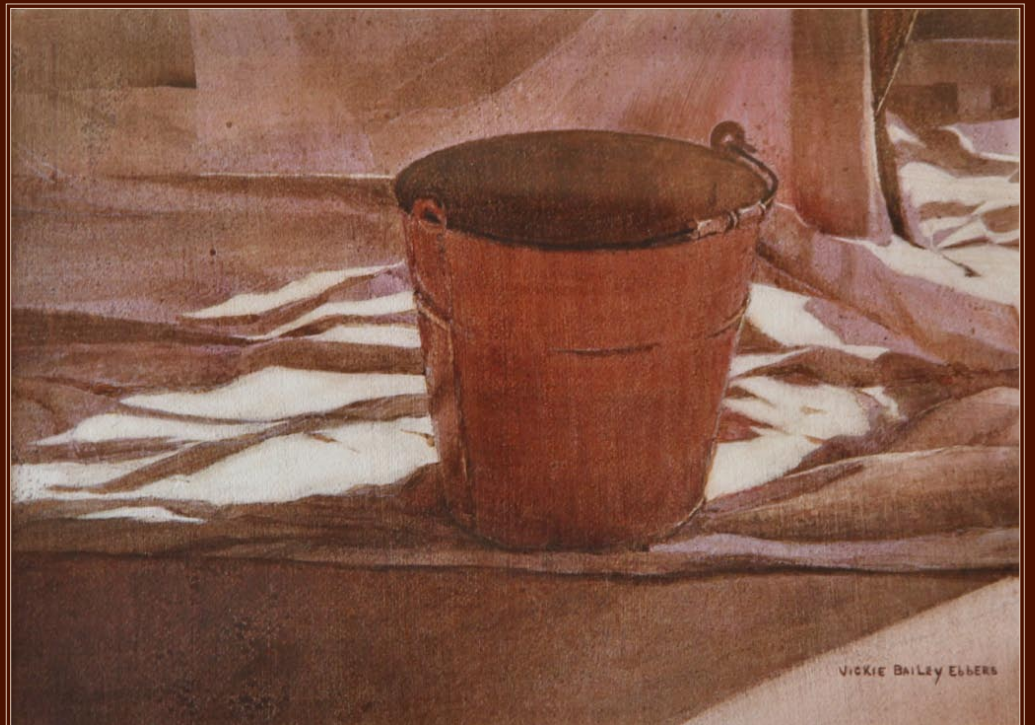
2014 Best in Show: Bills Bucket by Vickie Bailey