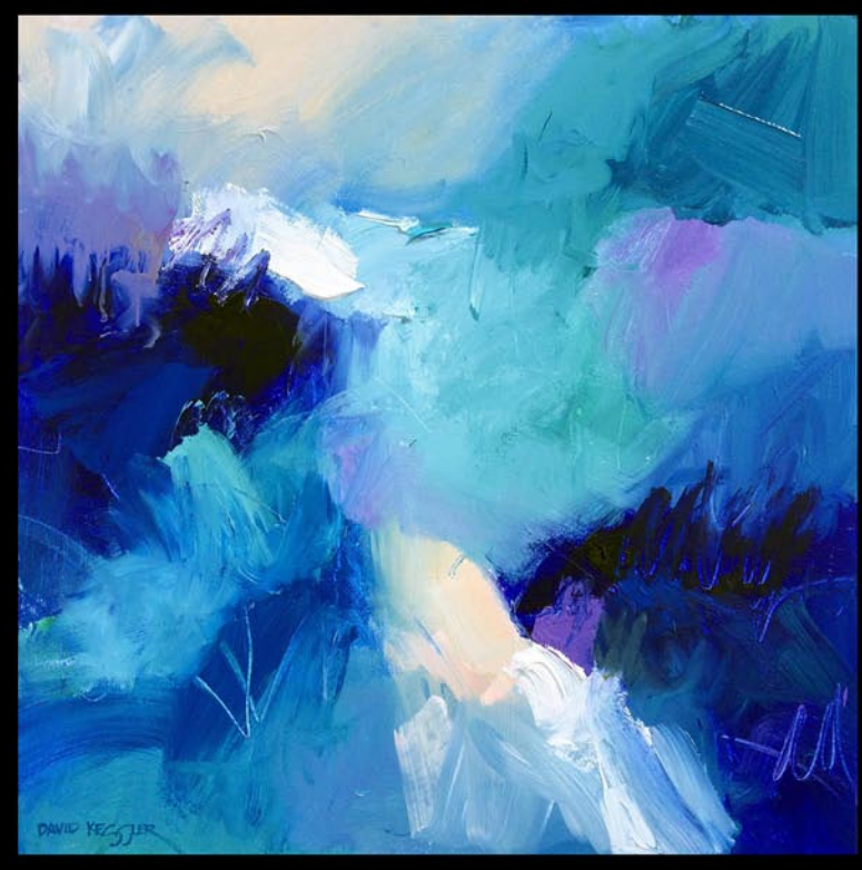
Lafayette Bleu, 30x30 Acrylic on Canvas

Residential and Corporate Commissions "Loosen-Up" Abstract Painting Workshops "Loosen-Up" Watercolor Painting Workshops Email: david@davidmkessler.com Phone: 336-418-3038