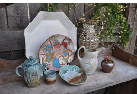
Works from Potteries participating in Tea with

Take a journey through Seagrove June 13, 2015, to have Tea with Seagrove Potters. It's the perfect time of year for a garden tea party with Blue Hen Pottery, Dean & Martin Pottery, Eck McCanless Pottery, Pottery Road Studio and Thomas Pottery