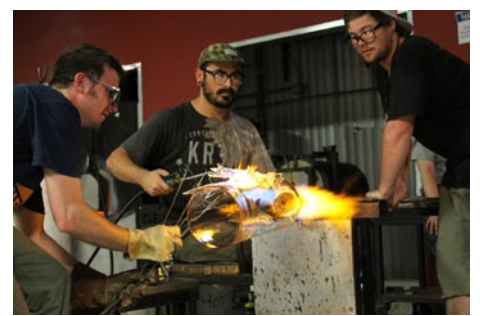
Hot Glass demo at STARworks

STARworks is located seven miles south of Seagrove at 100 Russell Drive in Star. For more information, visit (www.STARworksNC.org) or call 910/428-9001. Rhonda McCanless works full-time for Central Park NC and STARworks in Star and can sometimes be