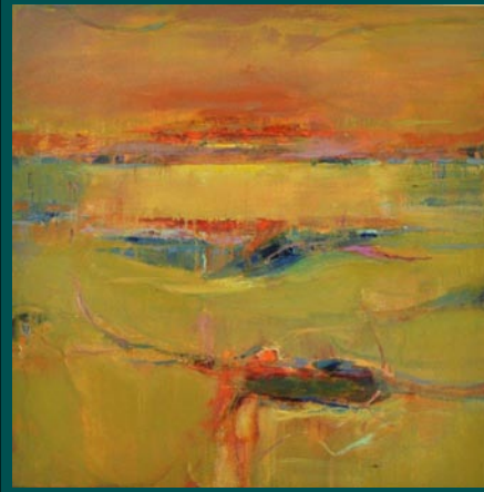
Tidal Pools II oil on canvas 30" x 30"

www.LauraLiberatoreSzweda.net Contemporary Fine Art by appointment