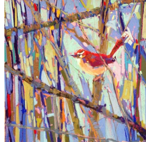
Work by Dianne Pike

For further information check our NC Institutional Gallery listings, call the Museum at 828/327-8576 or visit (www. HickoryArt.org).