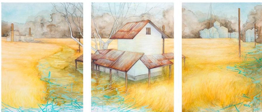
Work by Carly Drew

RIVERWORKS Gallery in Greenville, SC, will present Women Under Pressure: Converse Alumnae Printmakers , on view from June 15 through July 10, 2016. A reception will be held on July 1, from 1-9pm.