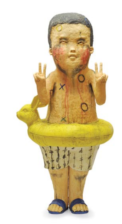
Work by Kensuke Yamada

The Penland Gallery & Visitors Center is located on Conley Ridge Road, just off of Penland Road in Mitchell County (near the town of Spruce Pine). It is the first building on your right as you enter the Penland campus.