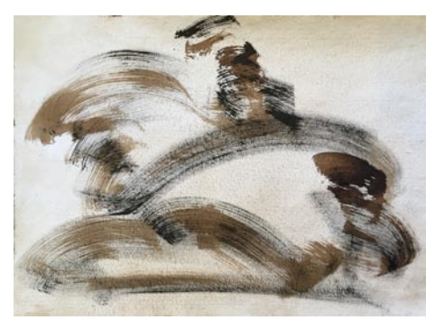
Work by Lese Corrigan

plied positive psychology, observes, the Japanese noun aware means "the bittersweetness of a brief, fading moment of transcendent beauty." This is the perfect description of the inspiration for the works in Rising – Neutrals.