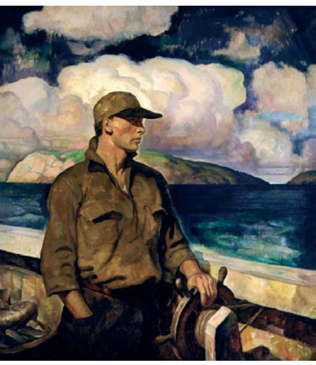
N. C. Wyeth (American, 1882–1945), 1944. Oil on hardboard. Bank of America Collection

The Mint Museum Randolph in Charlotte, NC, is presenting The Wyeths: Three Generations, Works from the Bank of America Collection, on view through Aug. 13, 2017. This exhibition is a testament to the profound artistic impact made by the Wyeth family, providing a window onto the careers of five of the family's artists through more than fifty remarkable paintings and drawings. For more than a century, the members of the Wyeth family have been renowned for creating works of art that fascinate and captivate the imaginations of their viewers, making the Wyeth tradition one of the most enduring and celebrated legacies in all of American art. For further information check our NC Institutional Gallery listings, call the Museum at 704/337-2000 or visit (www.mintmuseum.org)