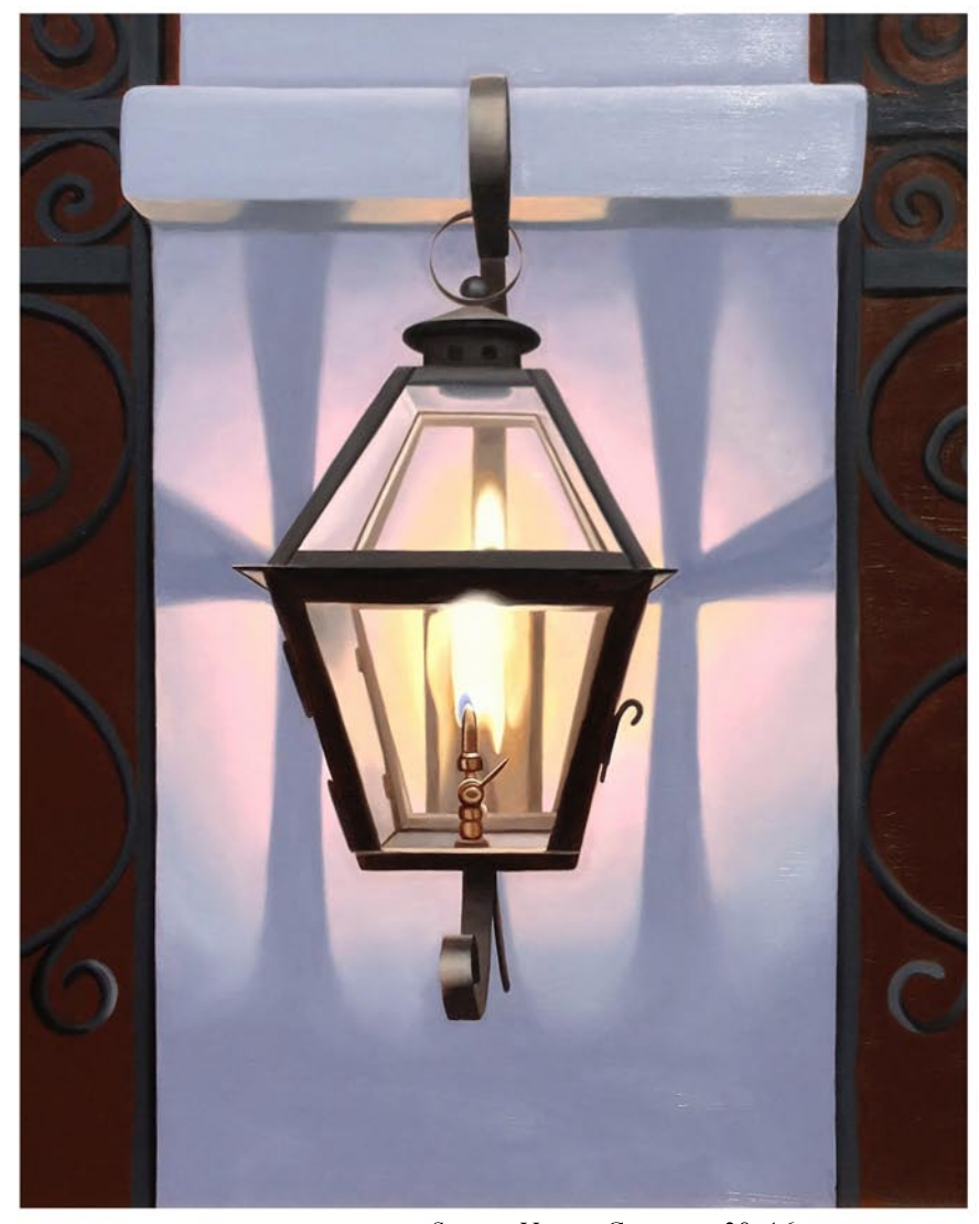
SPRUILL HAYES, GLOWING, 20x16, OIL ON CANVAS

THE SANCTUARY AT KIAWAH ISLAND 1 SANCTUARY BEACH DR, KIAWAH, SC 29455 843.576.1290