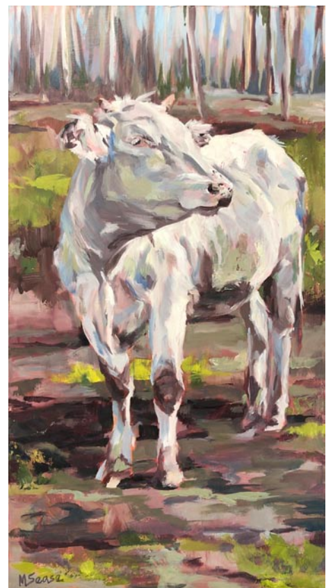
Work by Murray Sease

For further information check our SC Commercial Gallery listings or visit ( www.lapetitegallerie.com ).