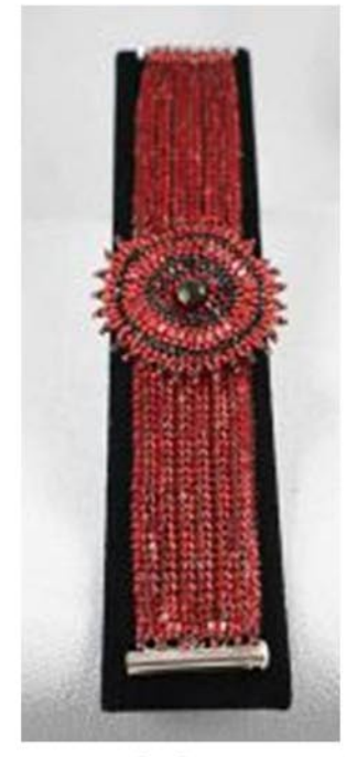
Jewelry by Gwen Pollard