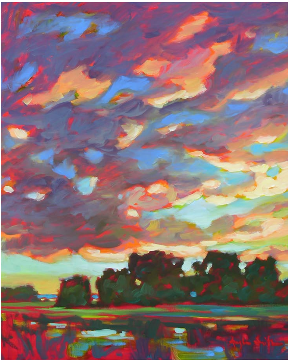
BETTY ANGLIN SMITH WARM FRONT 36X30 O/C