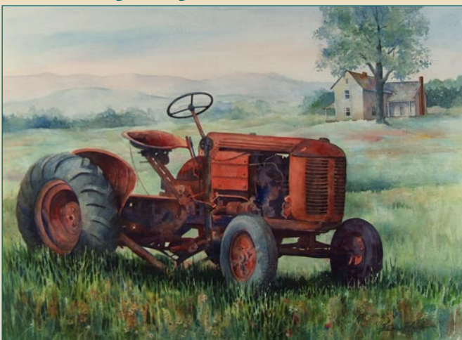
Tractor by Freeman Beard

Freeman Beard Watercolor Workshop July 12 - 14, 2012