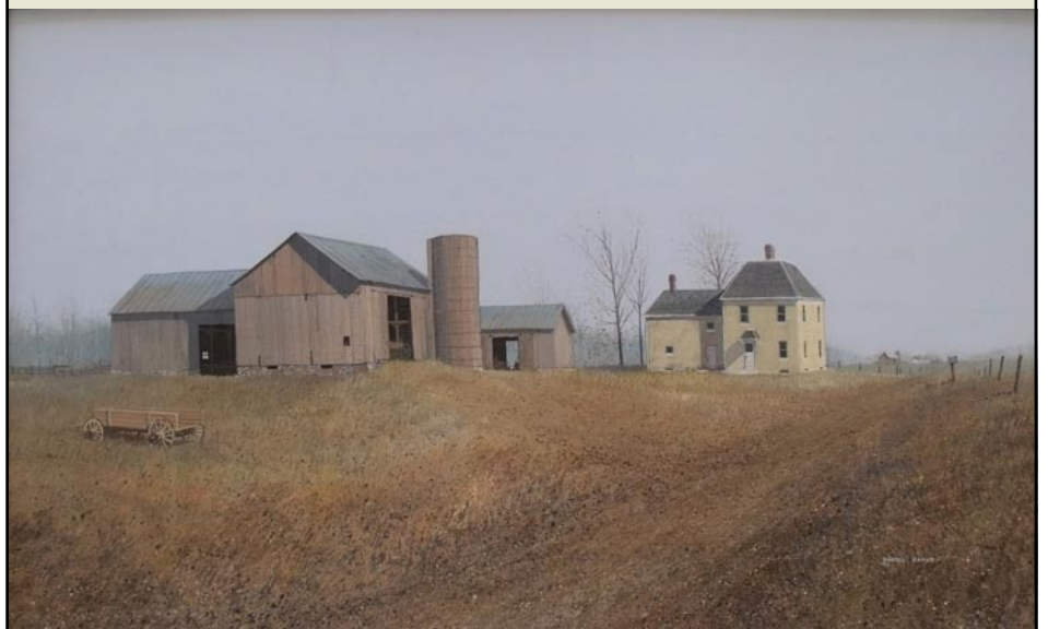
Autumn Road, 1970