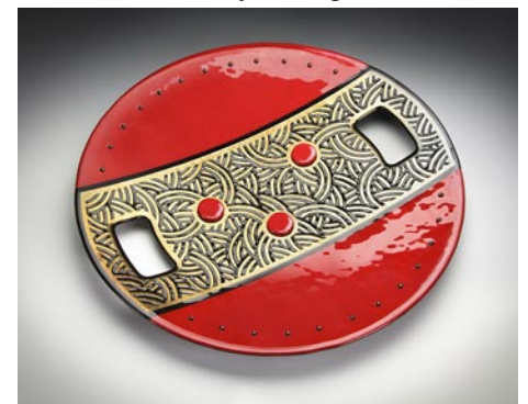
Work by Michael Lightcap.

3:30pm - Timberline: Smooth folk harmonies characterize this band featuring guitarist Gene Holdway, a travelling bluegrass troubadour with 30 years experience.