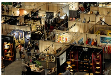
Crowd Scene.

Asheville, nestled within the Blue Ridge Mountains, provides the perfect backdrop for the Craft Fair. Long known as an arts and crafts destination, Asheville offers ar-