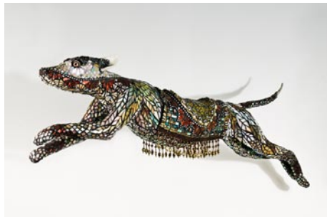
Work by Pam Isner

For further information check our NC Commercial Gallery listings, call the gallery at 919/732-5001 or visit ( www.hillsboroughgallery.com ).