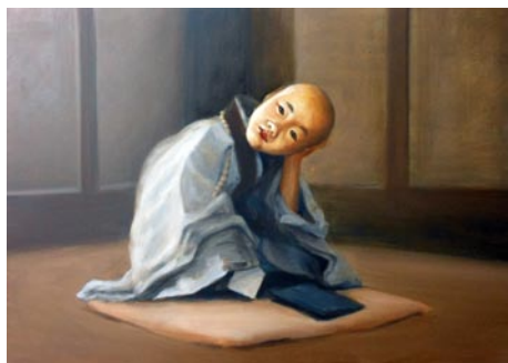
Work by Tessa Guze

colors and sweeping fabrics she portrays in her portraits of local people. She captures her subjects unflinchingly, presenting snapshots of their lives while also imbuing them with dignity and beauty.