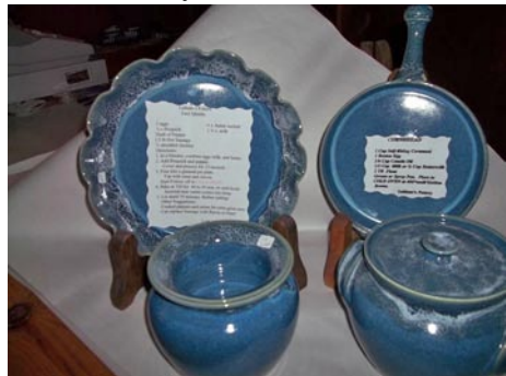
Works from Latham's Pottery

Three Seagrove pottery shops will celebrate anniversaries in July with special events. Latham's Pottery is celebrating 20 years on July 13, from 9am to 5pm. The open house celebration will feature new pottery items and old forms that haven't been made in a while. Those pots will be specially signed to commemorate Latham's 20th anniversary.