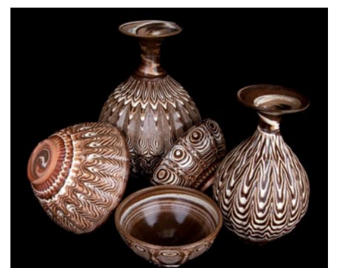
Works from Eck McCanless Pottery