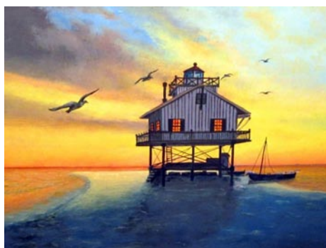
Work by Bill Henson

Institutional Gallery listings, call the Arts Council at 252/638-2577 or visit ( www.cravenarts.org ).