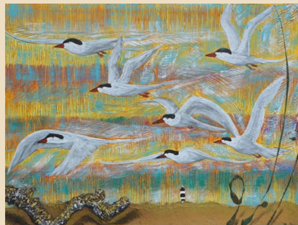
Birds Into Abstraction 14, by Reid Stowe

Reception on Saturday July 6, 2 - 5 p.m.