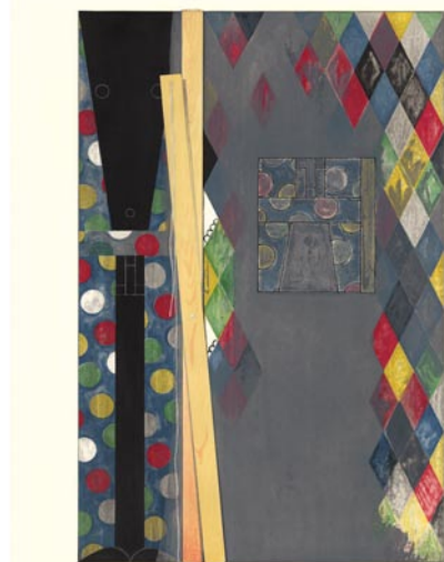
Bush Baby by Jasper Johns

The Mint Museum Uptown in Charlotte, NC, is presenting Women of Vision: National Photographers on Assignment , on view through July 20, 2014. Women of Vision features nearly 100 photographs highlighting the influential work of 11 award-winning female photojournalists, including moving depictions of far-flung cultures, compelling illustrations of conceptual topics such as memory and teenage brain chemistry, and arresting