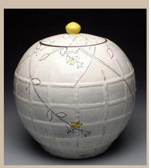
Work by Ben Carter

(http://www.carterpottery.blogspot.com/2009/05/welcome-totales-of-red-clay-rambler.html).