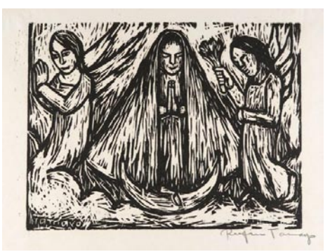
Rufino Tamayo, "Virgin of Guadalupe", 1930, woodcut on paper, 7 1/4 x 9 1/2 in. Museum purchase with funds from the Benefactors Fund,