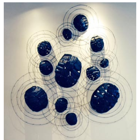
Randy Gachet “Repercussions” (2008): reclaimed rubber tire, steel wire, and acrylic mirror

Gallery and large groups are encouraged to call ahead.