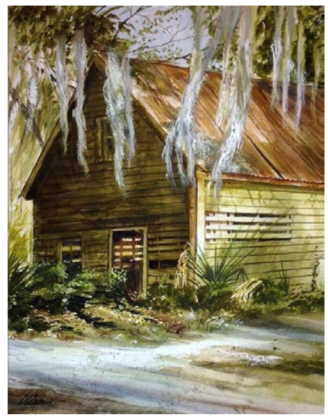
Work by Bill Winn

Sheryl's hand-constructed ceramics are reflective of the forests, shorelines, and towns of the Southeast and our Lowcountry. Her work often fuses natural elements with stoneware, creating dramatic and decorative, yet functional three-dimensional