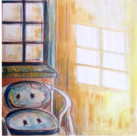
Work by Taylor Hayes

The full moon, an inspiration for six works presented by artist Dennis Millsaps in acrylic on canvas that depict the moon posed with shapes of color, texture & shadow. Billowing clouds, waves of color that form sinuous shapes that can be interpreted as human faces that express emotion animal forms that twist & dance, juxtaposing the shadows of the physical and spiritual as the viewer mediates on them.