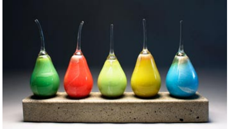
Works by Scott Summerfield

Western North Carolina has been a hotbed of contemporary crafts since the late 1960s, particularly glass, both sculptural and functional. Mica, the fine craft gallery in Bakersville, NC, has an exceptional glass show, Function and Fancy , running from July 23 through Sept. 21, 2015. What makes this exhibit of visiting artists especially interesting is that there are several generations of glassblowers represented. Their works show the diversity of styles that can be found in this one medium and the vibrancy, skill, and artistry of blown glass.