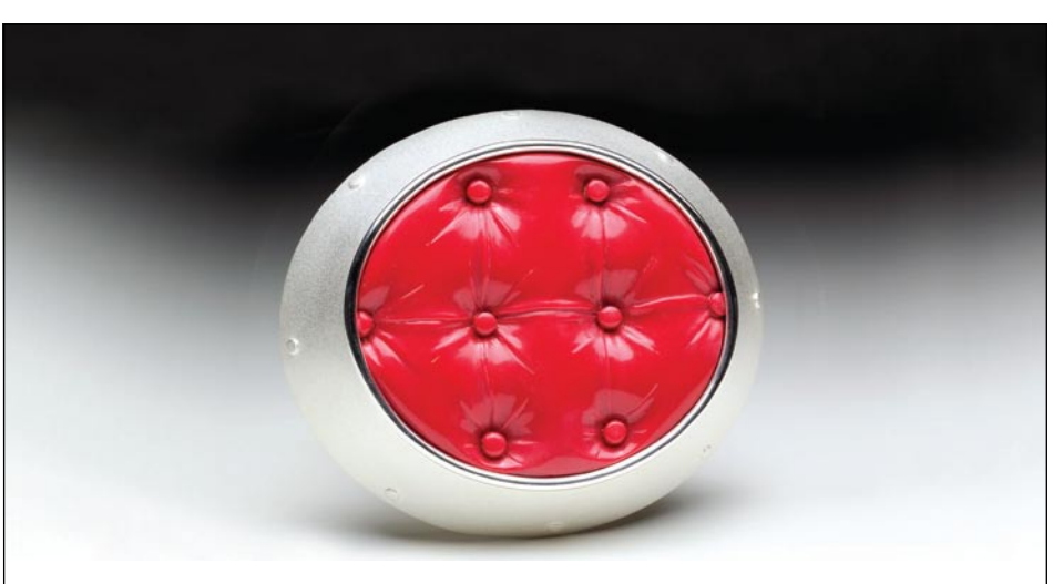
THERE'S A FINE LINE BETWEEN PRICELESS AND WORTHLESS.