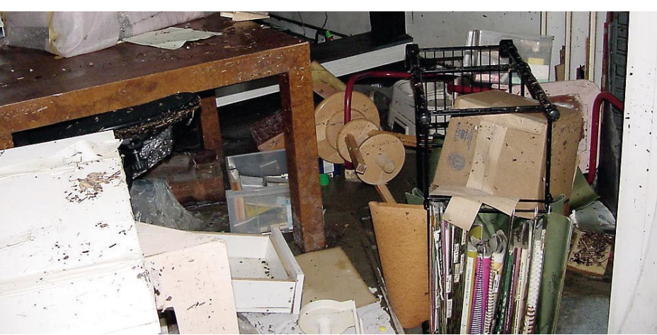
Artist Diane Falkenhagen's Texas studio — destroyed by flooding during Hurricane Ike, 2008

What would you do if you lost your work, your tools, your images, and a lot more to a flood? Metalsmith Diane Falkenhagen knows what five feet of contaminated saltwater