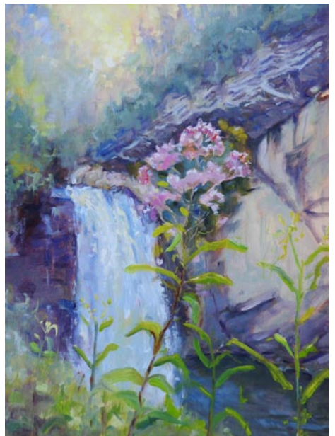
Work by Noelle Brault

beautiful mountain town of Brevard, enjoy specialty wines, and soak in all the lovely original art.