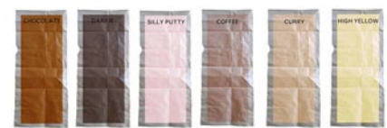
Work by IlaSahai Prouty

Historically, the paper bag test was said to have been used to separate black people into two categories – those lighter than a paper bag, and those darker. Access to parties and clubs was assigned based on this criteria. The artist remembers think-