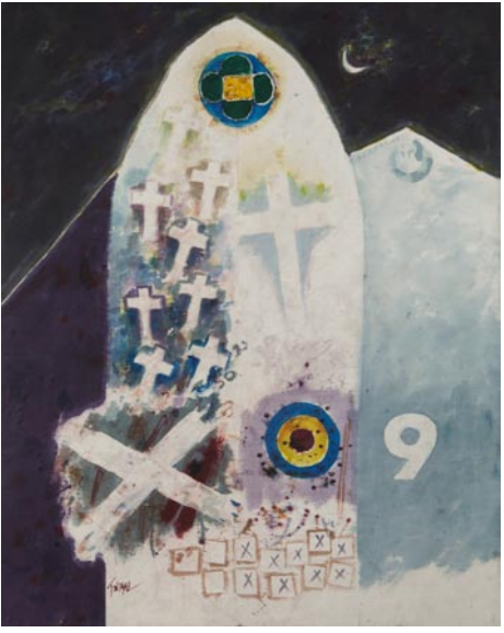
"Requiem for Mother Emanuel #7", 2016 (batik) 30" x 24"