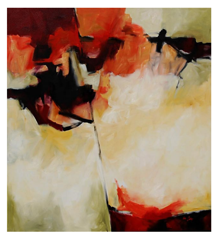
Fracture Oil on Canvas, 72 x 66 inches