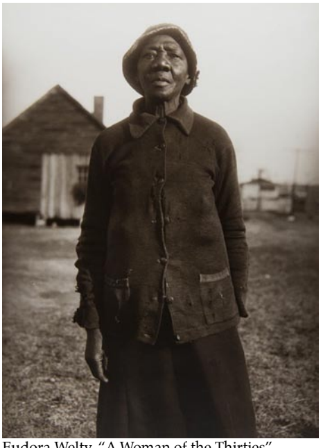
Eudora Welty, "A Woman of the Thirties" (Jackson), 1930s–early 1940s, printed 1992, toned gelatin-silver print, 17 1/4 x 12 1/2 in., Gift of Robert P. Venuti in honor of Lawrence J. Wheeler, © 1992 Eudora Welty, LLC, Courtesy Eudora Welty Collection–Mississippi Department of Archives and History.

The NC Museum of Art in Raleigh, NC, is presenting Looking South: Photographs by Eudora Welty , featuring a portfolio of 18 photographs, on view in the East Building, Level B, Julian T. Baker Jr. Photography Gallery, through Sept. 3, 2017. This exhibition features a portfolio of 18 photographs by the acclaimed American novelist and short story writer Eudora Welty (1909–2001), produced by the