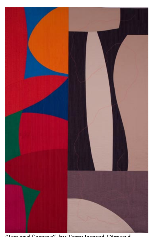
"Joy and Sorrow", by Terry Jarrard-Dimond, textile construction (hand-dyed cotton, machine stitched), 2008, 60" x 40"

Florence County Museum in Florence, SC, is presenting EVIDENCE: The Art of Terry Jarrard-Dimond, 1987-2017, on view in the museum's Special Exhibits Gallery, through Dec. 3, 2017. Jarrard-Dimond's first academic exposure to fine art came while attending painting and drawing classes at the Winthrop College. It was then that she began to notice a distinct difference between her approach to creating art and