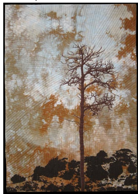
Work by Do Palma

Our policy at Carolina Arts is to present a press release about an exhibit only once and then go on, but many major exhibits are on view for months. This is our effort to remind you of some of them.