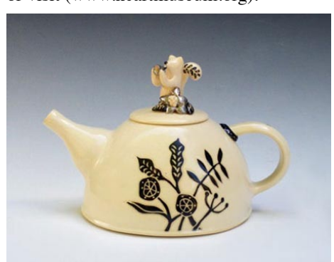
Work by Reiko Miyagi

Mississippi Department of Archives and History in 1992 (with Welty selecting the images and printing techniques) to represent the range of her photographs from the 1930s and early 1940s. For further information call the Museum at 919/839-6262 or visit (www.ncartmuseum.org).