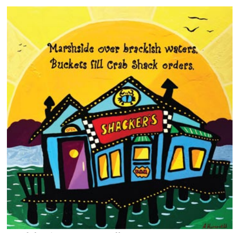
Work by Amos Hummell

For further information check our SC Institutional Gallery listings, call the League at 843/681-5060 or visit (www.ArtLeagueHHI.org).