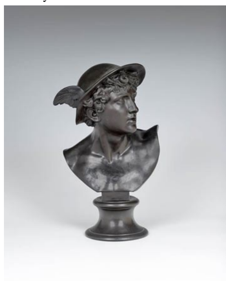
"Mercury", Wedgwood. Staffordshire, England, 1759–present, 19th century, Stoneware (black basalt). Collection of Lindsay Grigsby

Our policy at Carolina Arts is to present a press release about an exhibit only once and then go on, but many major exhibits are on view for months. This is our effort to remind you of some of them.