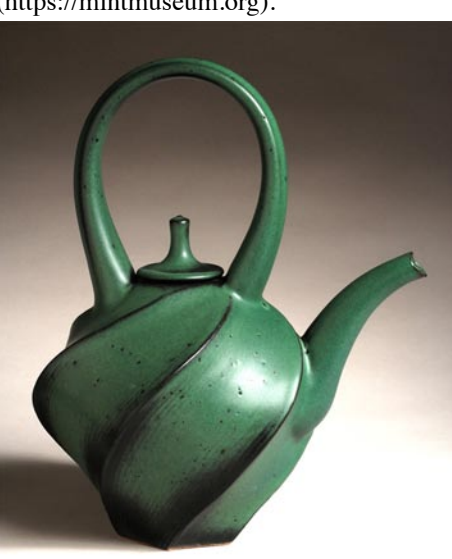
Work by Jim Connell Cedar Creek Gallery in Creedmore, continued above on next column to the right

United States and England, this exhibition is the first to focus exclusively on the black basalt sculpture made by Josiah Wedgwood and other Staffordshire potters in late eighteenth-century England. The works of art on view include life-size portrait busts, statues, vases, and other fully three-dimensional, ornamental forms, as well as works in low relief, such as large plaques, portrait medallions, and medals. For further information call the Museum at 704/337-2000 or visit (https://mintmuseum.org).