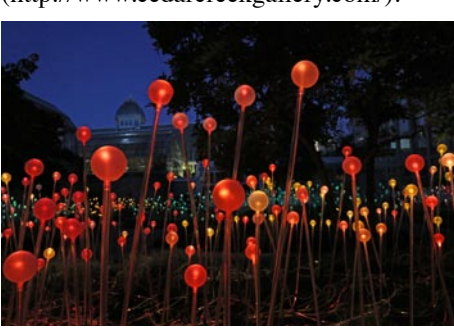
"Field of Light" by Bruce Munro.

NC, is presenting the National Teapot Show XI, on view through Sept. 7, 2020. They are shifting plans to bring the Cedar Creek Gallery National Teapot Show XI to viewers in a slightly different way. Our doors are currently closed (you might want to check to see if they have opened by now), and we miss the regular cadence of life in the gallery, but the reality is we do not know when that will return. Because our focus is, and always will be, helping American craftspeople make their living producing craft, we plan to make this teapot show the most successful one ever! The show is being photographed in its entirety and presented on (shopcedarcreekgallery.com). All the teapots in the National Teapot Show XI are available for purchase now. Teapots that are sold must remain on display in the gallery as part of the exhibit until the show closes on Sept. 7, 2020. After the show closes, teapots will be carefully packed and shipped by Sept. 21, or available for pick-up at the gallery. For further information check our C Commercial Gallery listings, call the gallery at 919/528-1041 or visit (http://www.cedarcreekgallery.com/).