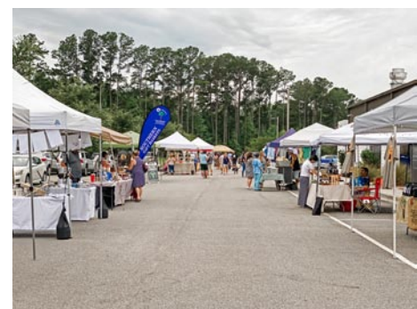
View of the Bluffton Summer Night Market

Lowcountry Made is an online community whose mission is to promote Lowcountry makers, connect them with shoppers, and promote business-to-business collaboration. In addition to regular