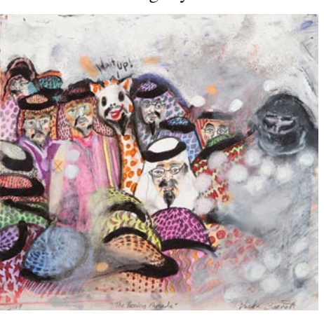
Work by Viveka Barnett

City Art in Columbia, SC, is presenting a new exhibition in the main gallery, on view through Aug. 27, 2011, showing a collection of drawings by Viveka Barnett.