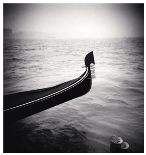
Ferro da Gondola by Michael Kenna

The Columbia Museum of Art introduces English photographer Michael Kenna, through an exhibition of his extraordinary Venezia series. Featuring 53 black and white images photographed between 1980 and 2008, Kenna's photographs provide an incredibly striking and unique portrait of Venice, Italy. The exhibit, Michael Kenna: Venezia demonstrates the photographer's ability to produce highly atmospheric, eerily beautiful and almost surreal images that offer a fresh interpretation of the world's most photographed city. The exhibit will be on view through Oct. 23, 2011.