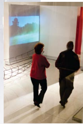
MFA Exhibit, "Everything Like it was Yesterday"