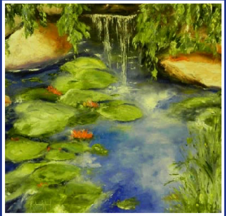
'The Lily Pond'' by Melanie Wood http://bitly.com/oJroOZ