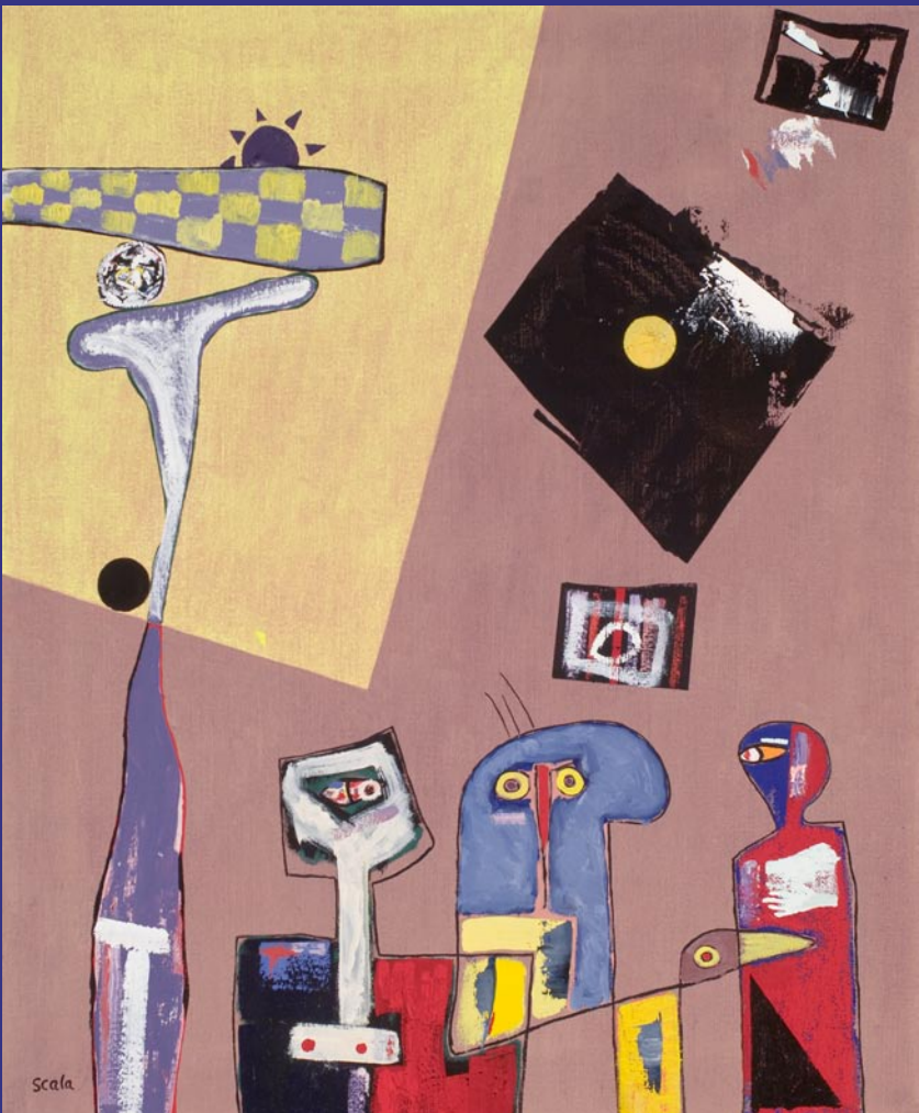
"Yesterday's Tomorrow is Today"