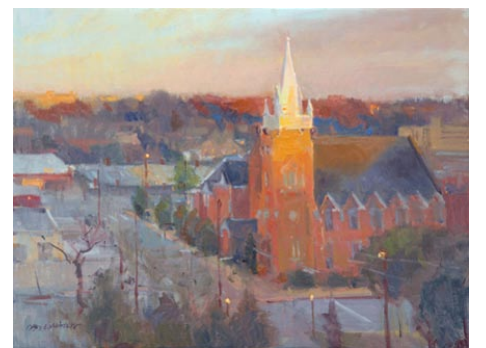
Work by Dawn Whitelaw

Nicole's Studio & Art Gallery in Raleigh NC specializes in local to nationally recognized artists with a focus on Contemporary