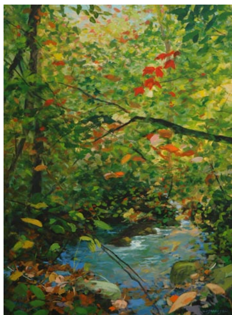
Work by William Jameson

landscapes embodying the full range of local color and timeless contrasts, whether the setting captures the brilliant, warm colors heralding the arrival of fall in the North Carolina mountains or the rich Tuscan countryside dotted with cool blue/green olive fields in bloom among the red-earth shades of freshly upturned soil. Rejecting the term "scene" in reference to these works, Jameson defines his landscapes as "explorations."