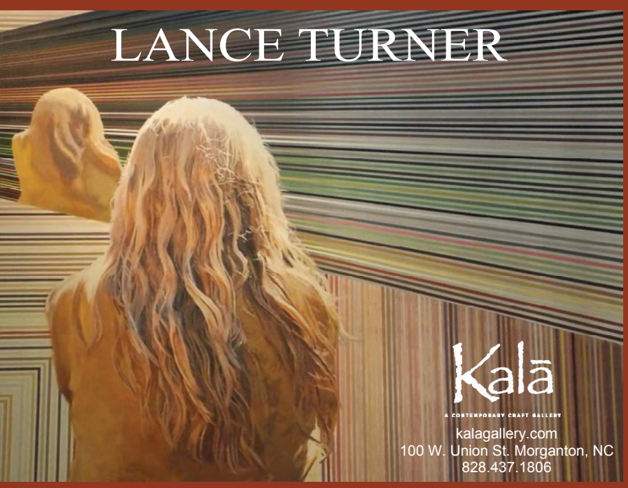
The Treachery of Images

TERRY JARRARD-DIMOND * * * Thoughts on Juried Exhibitions