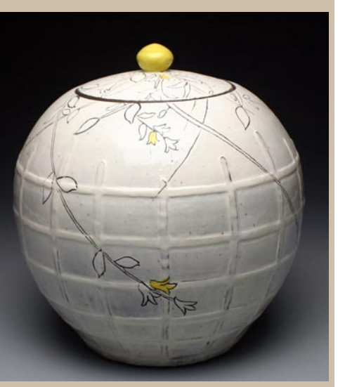
Work by Ben Carter

(<u>http://www.carterpottery.blog-spot.com/2009/05/welcome-to-tales-of-red-clay-rambler.html</u>).