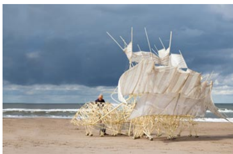
Work by Theo Jansen

The VISIONS 2014: Invention as Art exhibition explores the realm of inventions in 2D and 3D format, showing artwork in the form of drawings and sculptural works, including kinetic sculpture