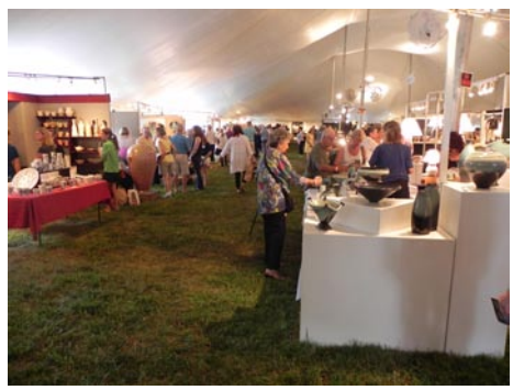
View of last year's Potters Invitational

Once again, collectors and pottery lovers will have access to the latest works by leaders in the rich tradition of North Carolina pottery when potters from across North Carolina and surrounding areas return to Mint Museum Randolph in Charlotte, NC, for the 11th annual Mint Museum Potters Market Invitational on Saturday, Sept. 12, 2015, from 10am to 4pm. Admission is $10 including admission to the Museum. Children 12 and under are admitted free.