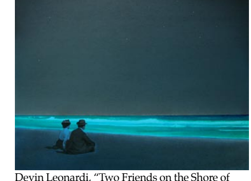
Devin Leonardi, "Two Friends on the Shore of Long Island", 2009, acrylic on paper.

The Columbia Museum of Art in Columbia, SC, is presenting From Marilyn to Mao: Andy Warhol's Famous Faces, on view through Sept. 13, 2015. The exhibition is a thematically-focused look at the artist's influential silkscreens and his interest in portraits. Andy Warhol (1928-1987) is central to the pop art movement and one of the best-known 20th-century American artists. From Marilyn to Mao uses 46 of Warhol's famous portraits to explore pop art's tenet of the cult of celebrity, the idea that pop culture adores the famous simply because they are famous. Warhol exploited society's collective obsession with fame like no artist before or after him. The exhibition celebrates the Mao suite, an anonymous gift to the CMA of the complete set of 10 silkscreens Warhol created in 1972 of Mao Zedong, chairman of the Communist Party of China (1949-1976). For further information call the Museum at 803/799-2810 or visit (www.columbiamuseum.org).