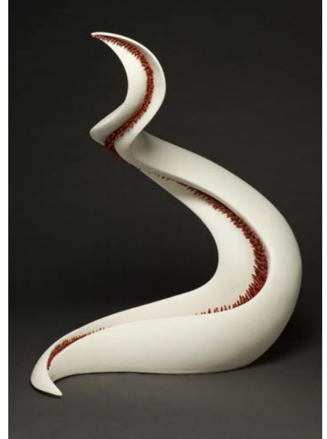
Work by Holly Fisher

"In a community where people were not accustomed to visiting galleries, we needed to figure out a way to make them accessible and enjoyable," said Scott. "The very first